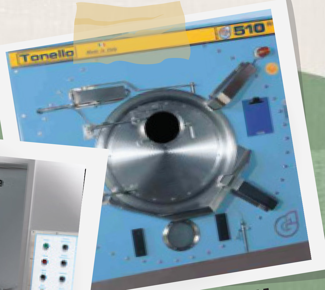
TONELLO UP ARM